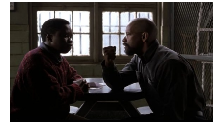
Figure 10. Innocent Moves