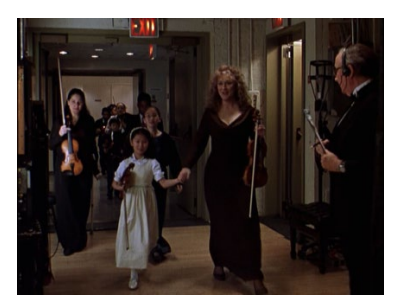
Figure 6. Music of the Heart

IMDB: https://www.imdb.com/title/tt0406816/ IMDB: https://www.imdb.com/title/tt0080684/ IMDB: https://www.imdb.com/title/tt0166943/